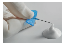
2% Polidocanol · 23G needle