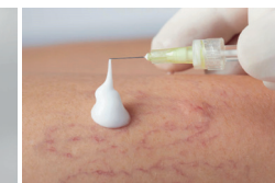
0.2% Polidocanol · 30G needle