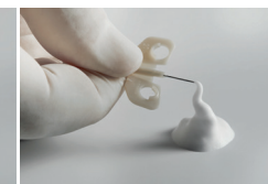
0.5% Polidocanol · 27G needle