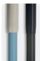
Competitors' sheath-to-dilator transitions